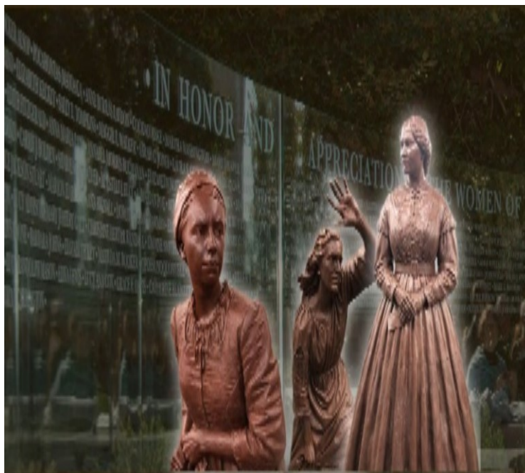
Virginia Women's Monument