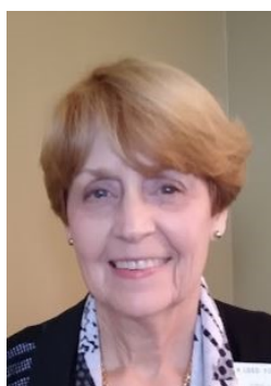
Cilla Tomme (Former First Lady)